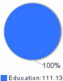
Table 1: MSYs by Focus Areas