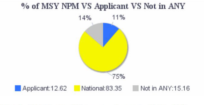
Table3: %MSYs by NPM vs.Applicant vs. Not in ANY