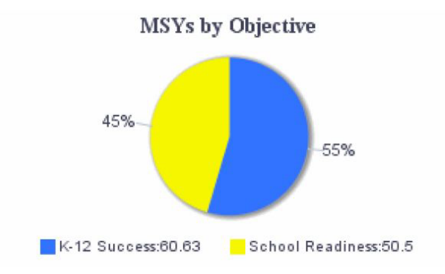
Table2: MSYs by Objectives

Table 2 and its corresponding pie chart show the same MSY information expressed as percentages of the total MSYs: